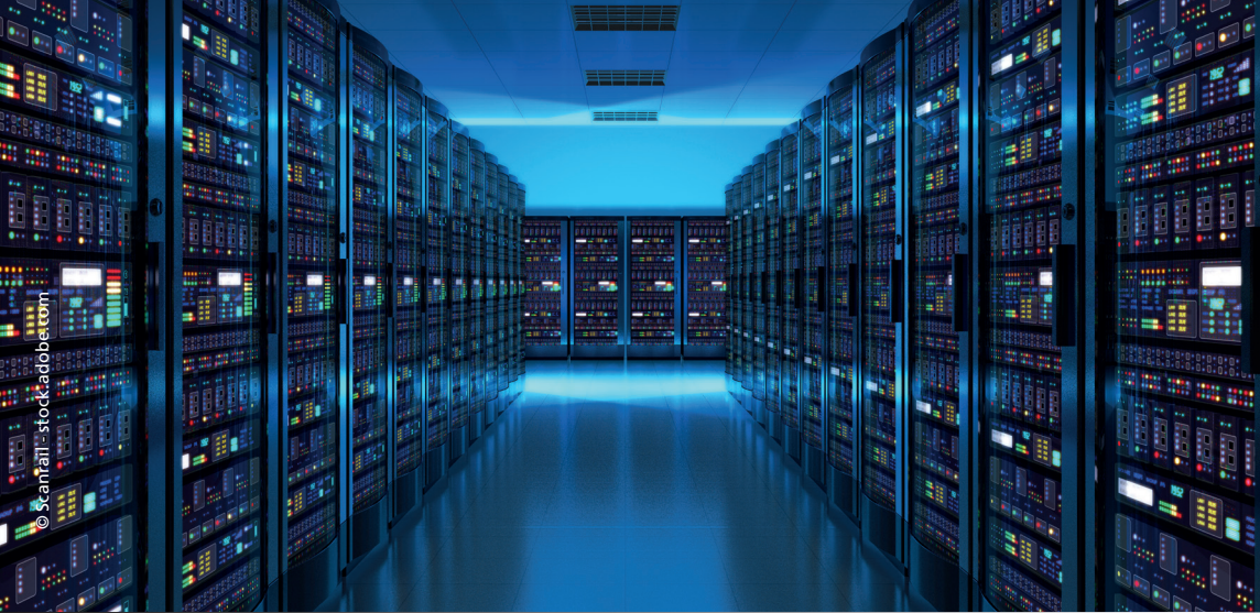
Machine learning enables access to data treasures