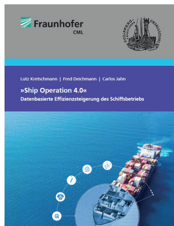
The study „Ship Operation 4.0“ is now available from Fraunhofer-Verlag.

based increase in efficiency of ship operation. The white paper „Ship Operation 4.0“ has been published by Fraunhofer Verlag and can be obtained for a nominal fee.